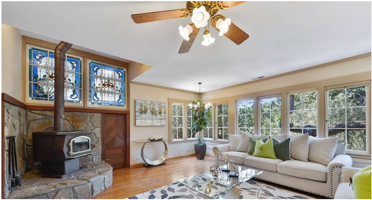
Photograph 3 890 Upton Road. The living room shows the remodeling and inclusion of paired art glass windows, stone behind the wood stove and on the floor to raise the stove.