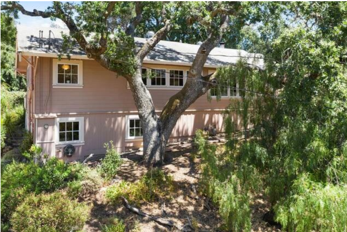
Photograph 2 890 Upton Road View: Side Façade