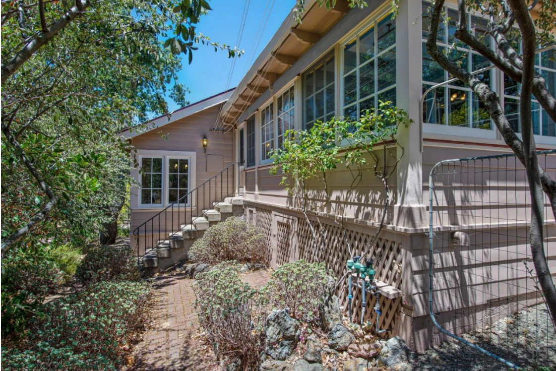
Photograph 5 890 Upton Road - Rear and side of the building, showing the elevation change in the two sections.