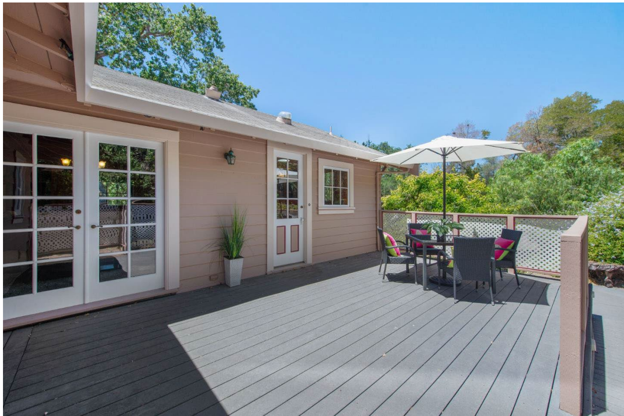
Photograph 4 890 Upton Road New raised Side deck and remodeled side of the house.