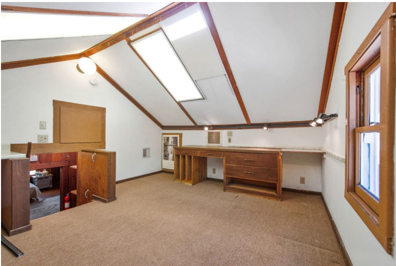
Photograph 6 890 Upton Road Second level remodeled roof with skylights.