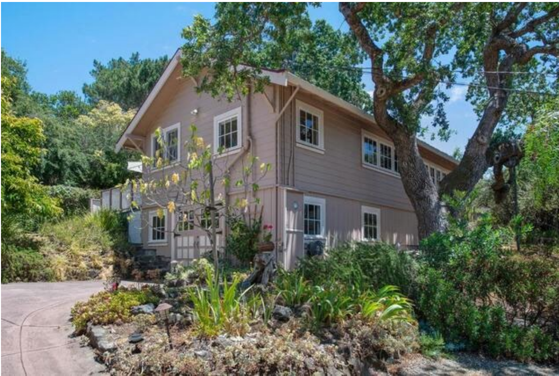
Photograph 1 890 Upton Road View: Front end of the building facing the street and side façade. This appears to be the older section.