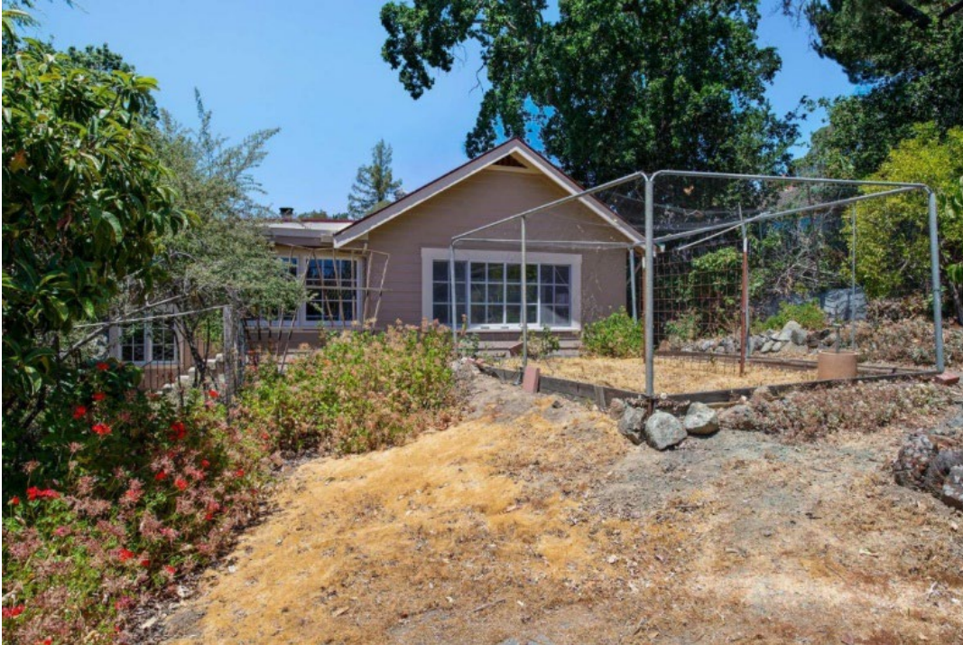
Photograph 7 890 Upton Road – Rear of the house, showing the back of the side addition.

In summary, the building is in good condition and has been extensively altered by the addition of non-original materials, replacing the windows with art glass from a different period as well as various other modifications that have changed the character of the original design.