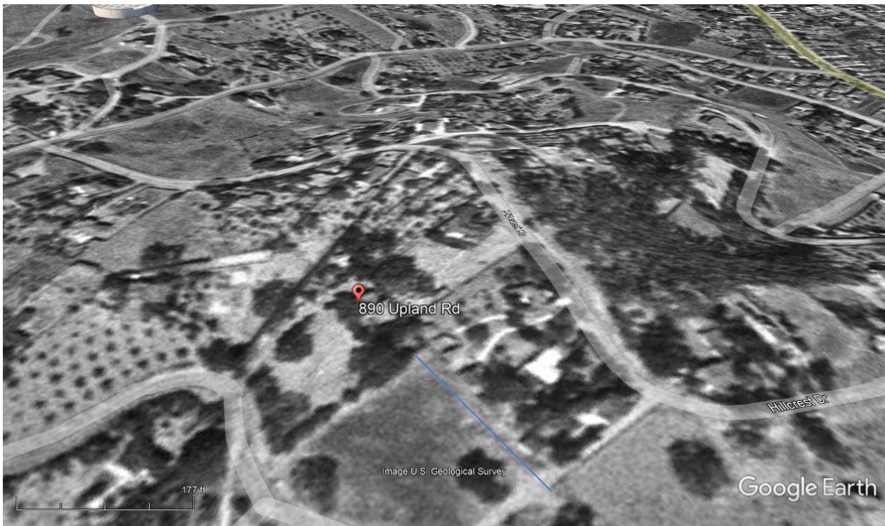
Figure 3 Historic aerial view of the area in 1947.