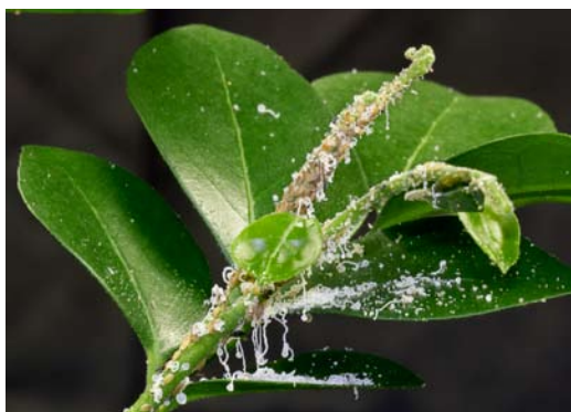
Figure 21. Heavy infestation of psyllids on Murraya .