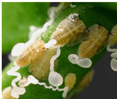
Figure 8. Waxy tubules produced by nymphs.

Asian citrus psyllid females lay their bright yellow-orange, almond-shaped eggs on the tips of growing shoots or in the crevices of unfolded “feather flush” leaves (fig. 6). The number of eggs laid is dependent upon host plant. For example, a mean of 857 eggs per female was deposited on grapefruit, whereas a mean of 572 eggs per female was deposited on rough lemon. At 77°F (25°C), the eggs hatch in about 4 days (Tsai and Liu 2000).