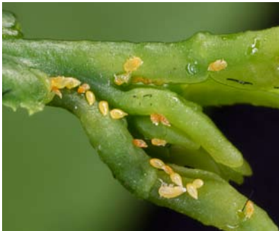
Figure 6. Psyllid eggs and hatching nymphs.