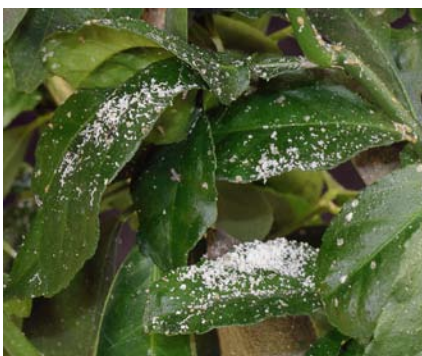
Figure 20. Honeydew, sooty mold, and waxy tubules produced by psyllids.