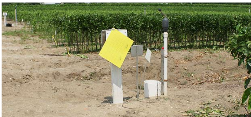
Figure 22. Yellow sticky card for adult psyllid detection.