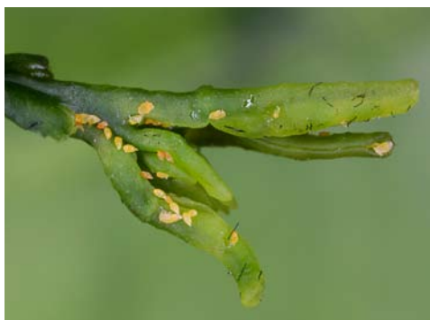
Figure 19. Psyllid eggs and nymphs tucked into crevices and folds.