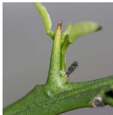
Figure 18. The characteristic body tilt of the adult citrus psyllid.