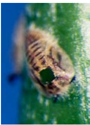
Figure 25 Exit hole in a dead psyllid, indicating previous parasitism.