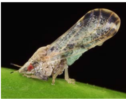
Figure 5. Psyllid adult feeding.