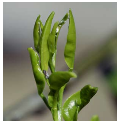
Figure 17. Twisted tips of citrus foliage caused by psyllid feeding.

If you suspect that you have found this psyllid, place the infested plant in a container or place adults and nymphs in alcohol and contact your local county agricultural commissioner's office for identification. If the find is determined to be Asian citrus psyllid, the extent of the infestation will be delineated using visual surveys, and the appropriate regulatory actions will be taken to minimize the spread of Asian citrus psyllid from the site. Regulatory steps may include infested plant destruction, insecticidal treatment of plants around the infestation, quarantine of the area, and additional surveys and treatments of the area during periods of new flush.