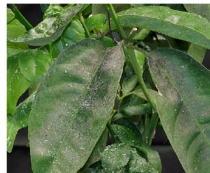
Figure 9. Sooty mold growing on the honeydew excreted by the nymphs.